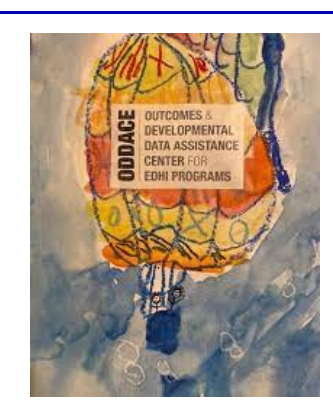
"ODDACE: Outcomes & Developmental Data Assistance Center for EHDI Programs"

"Telehealth Visits for Children Who Need Hearing or Vision Help" is a webpage of information for families with children using telehealth who have vision loss and/or are deaf or hard of hearing. This resource and other resources provided by HealthyChildren.org from the American Academy of Pediatrics.