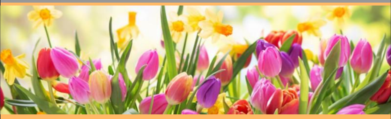
March - April E-news

Family Leadership in Language & Learning (FL3)